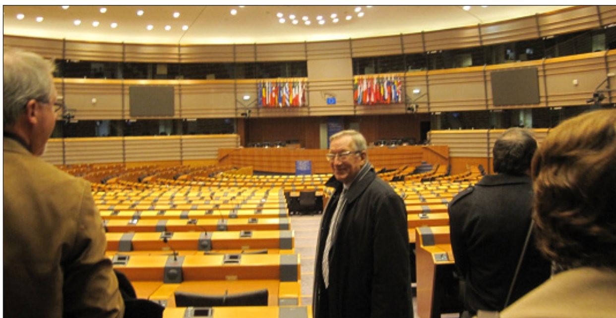
Members of the ECN visiting the plenary room of the European Parliament