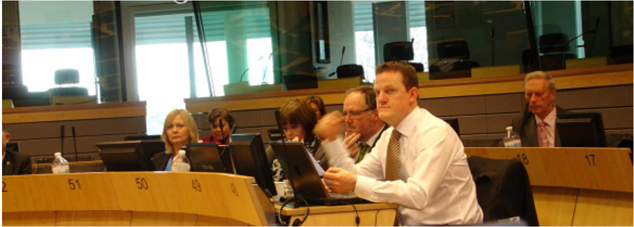
Participants listening to the different presentations about 'Green Cities' at the ECN seminar