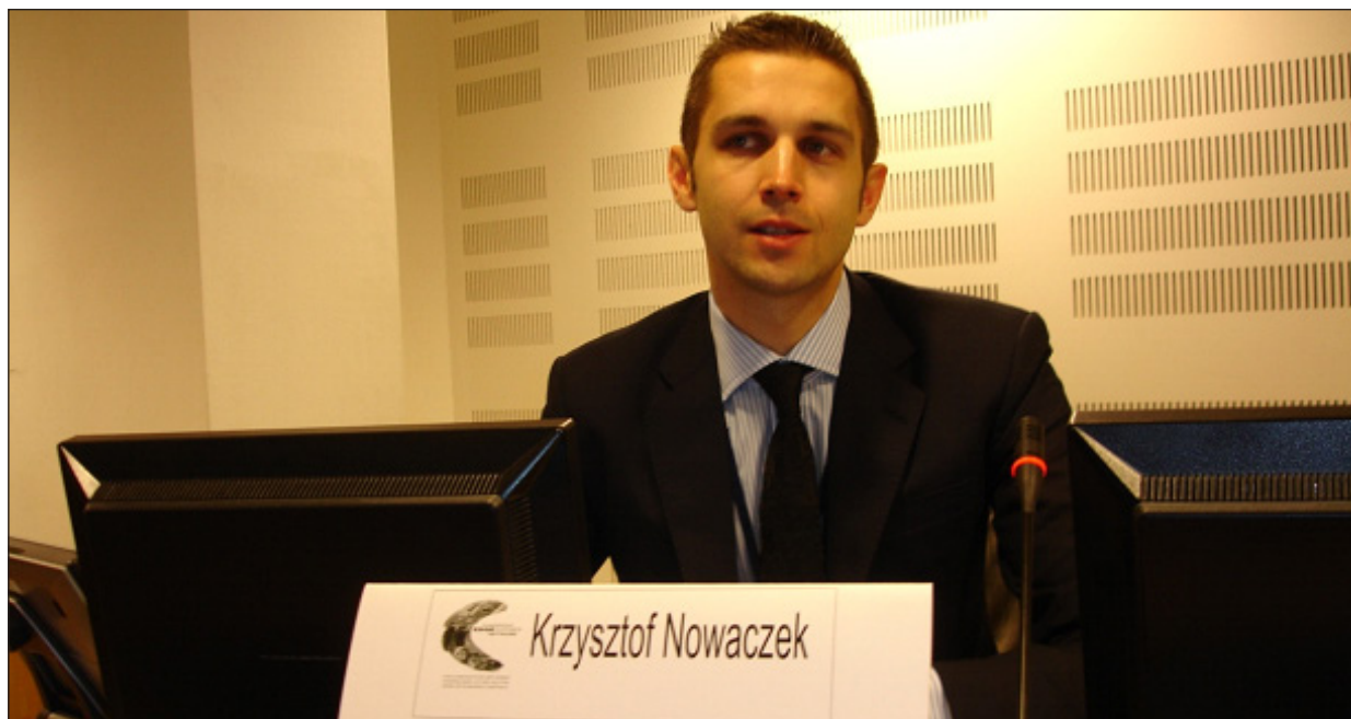
Mr. Krzysztof Nowaczek was representing the Monitoring Platform of the CoR – a collaboration between cities and regions of Europe about the implementation of the Europe 2020 strategy

Responsible for the Europe 2020 monitoring Platform, Mr. Krzysztof Nowaczek, from the Committee of the Regions, spoke about the role of regions and cities in the implementation process of the new Europe 2020 strategy.