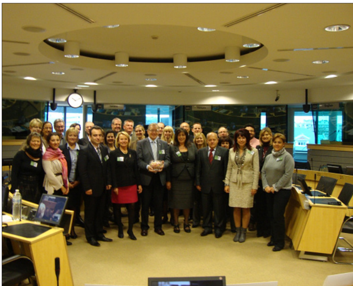
Participants at the ECN Biannual Meeting in Brussels 10th-12th November 2010: