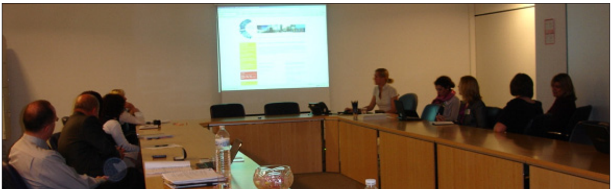
The ECN Steering Group meeting took place Wednesday afternoon. At the meeting the Steering group e.g. worked on the new ECN website.

Please find the Minutes from the Steering Group in the Annex.